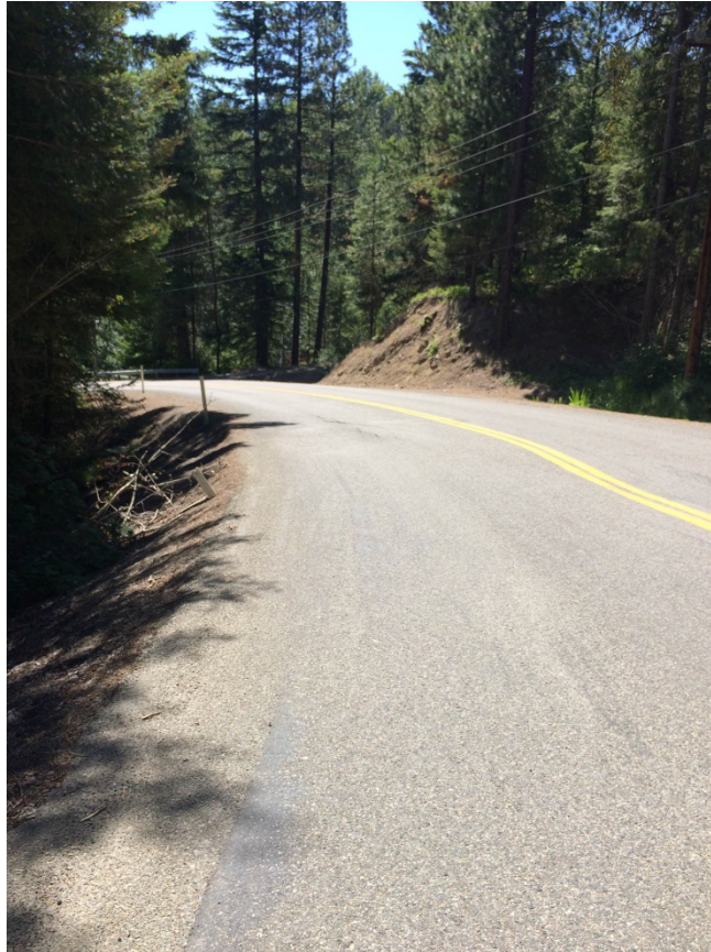
Mohar Rd between MP 1.90 and MP 2.01 looking west (2017)