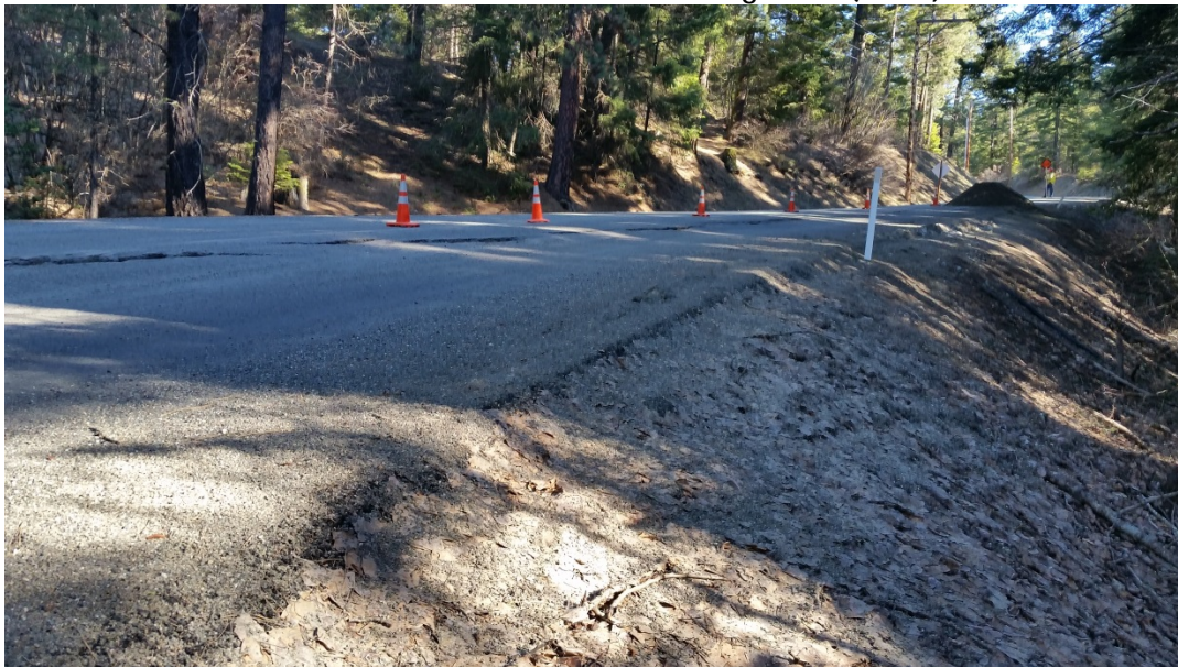
Mohar Rd between MP 1.90 and MP 2.01 looking northeast (2018)