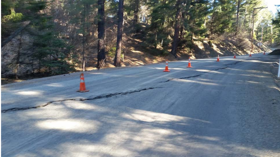
Mohar Rd between MP 1.90 and MP 2.01 looking east (2018)